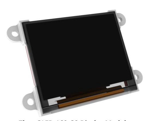
The uOLED-160-G2 Display Module

NOTE (*): Arduino remains the property of the Arduino Team. All references to the word Arduino and Arduino Hardware are licensed under the Creative Commons Attribution Share-Alike license.